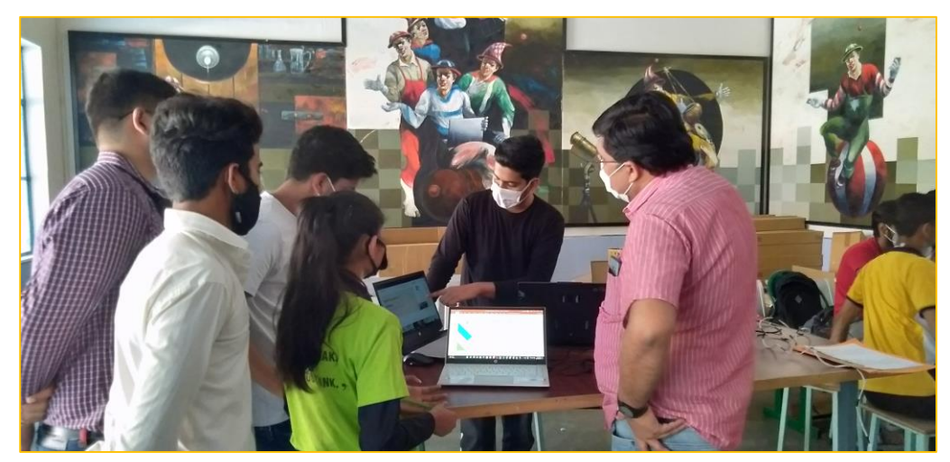
Team: GEEKY GUYS